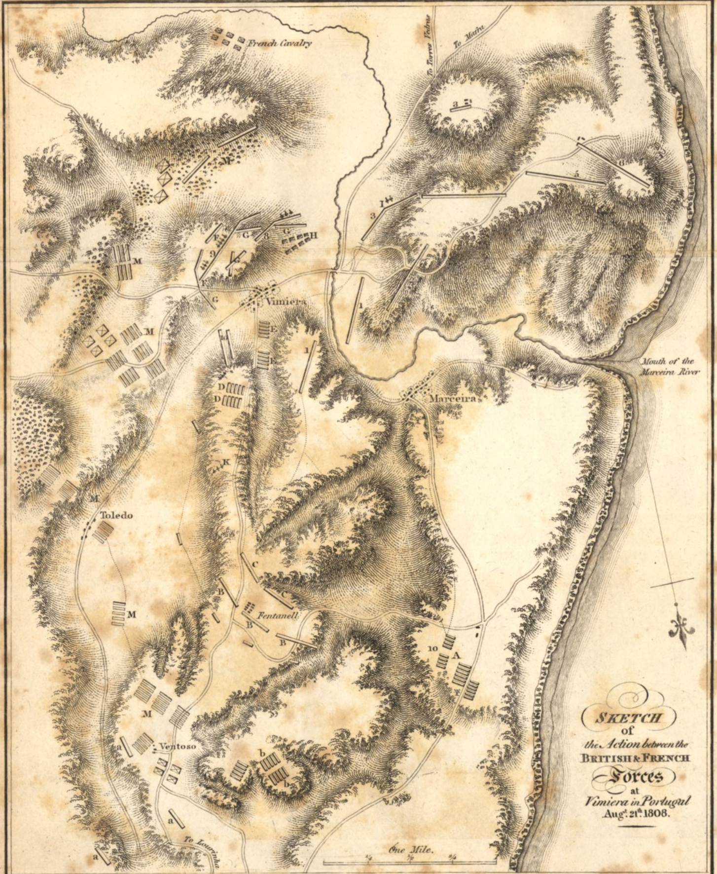
SKETCH of the Action between the BRITISH & FRENCH Forces at Vimiera in Portugal Aug r . 21 th . 1808.