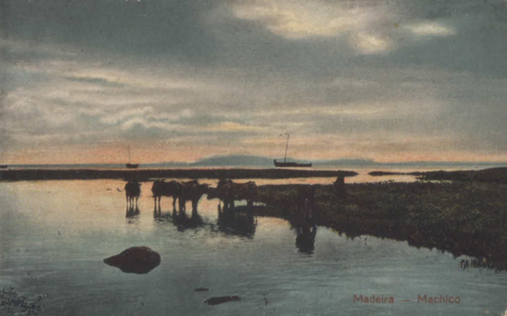
Madeira — Machico