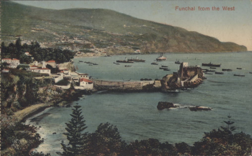
Funchal from the West