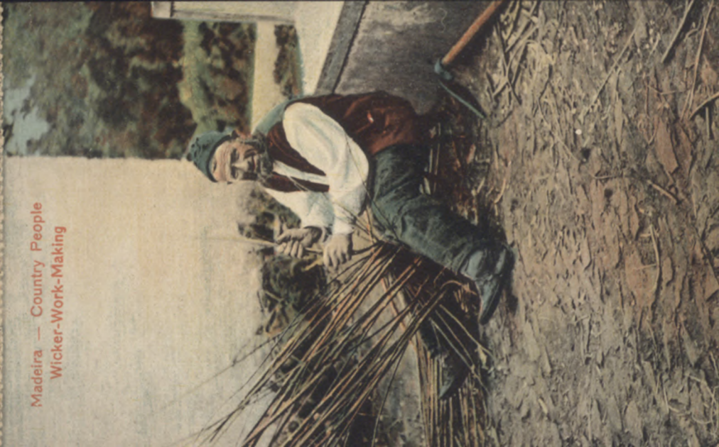
Madeira — Country People Wicker-Work-Making