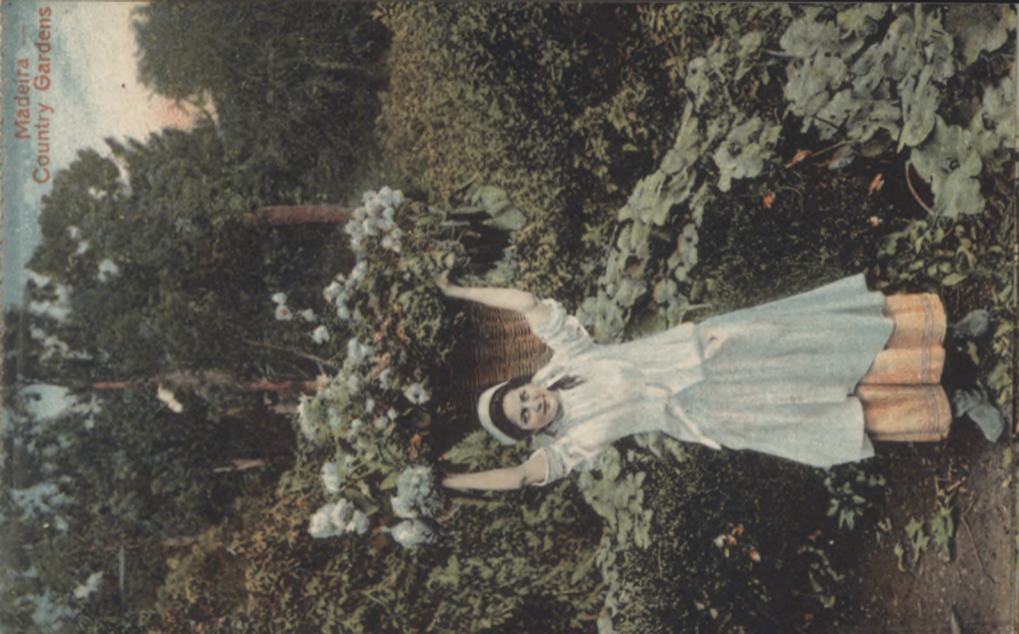
Madeira — Country Gardens