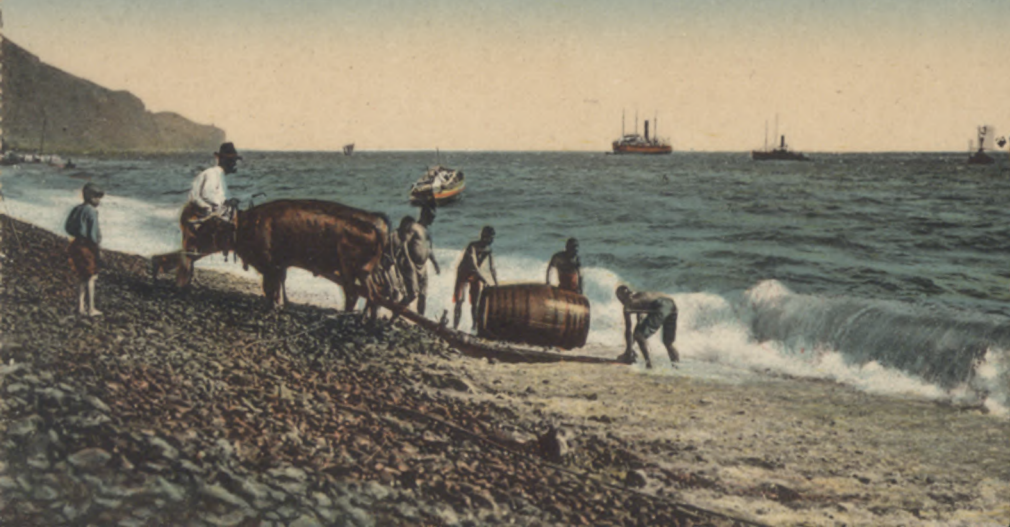
Madeira — Landing Wine from the Country