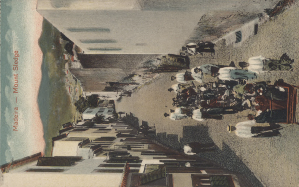
Madeira — Mount Sledge