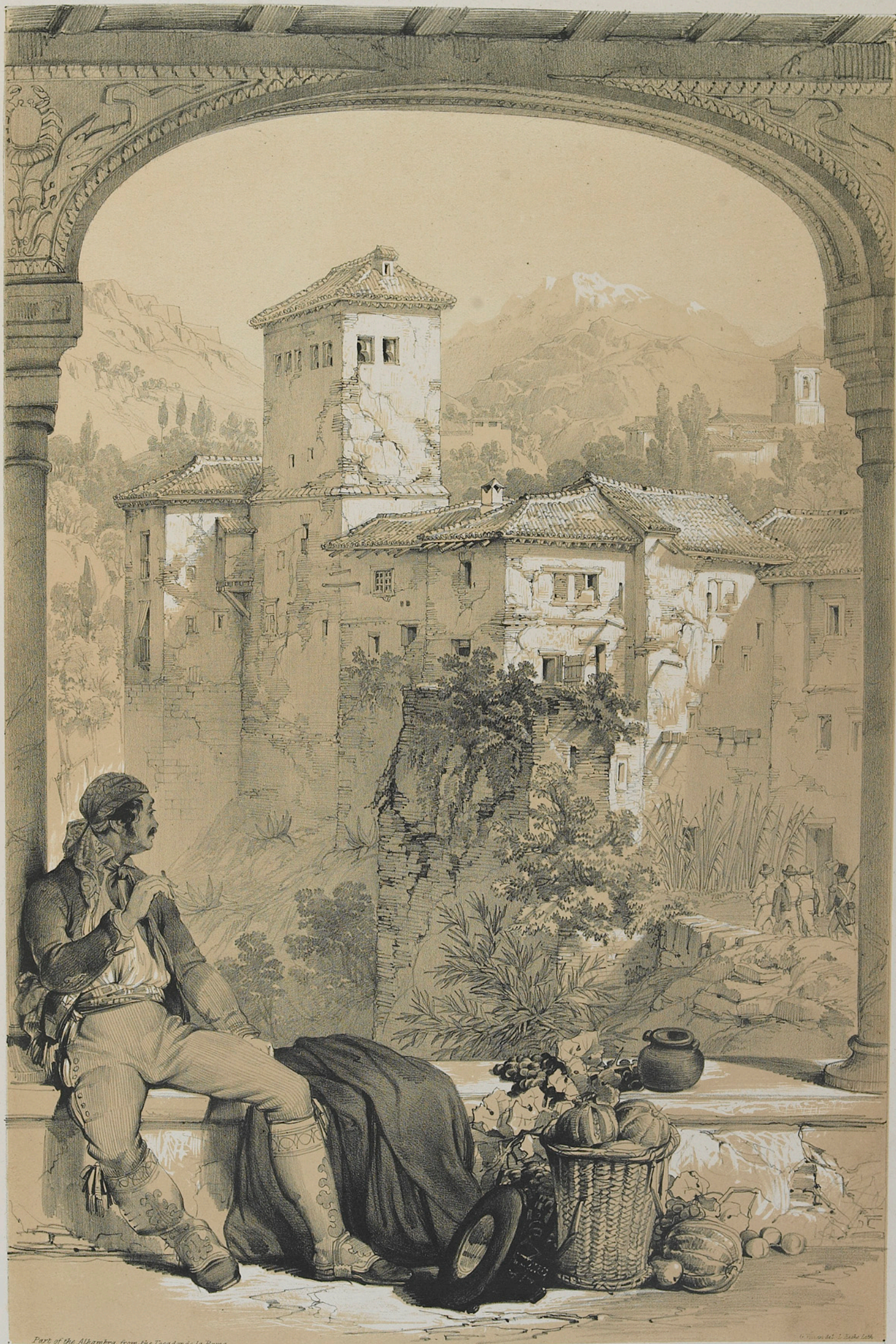
Part of the Alhambra, from the Tecedor de la Reina.