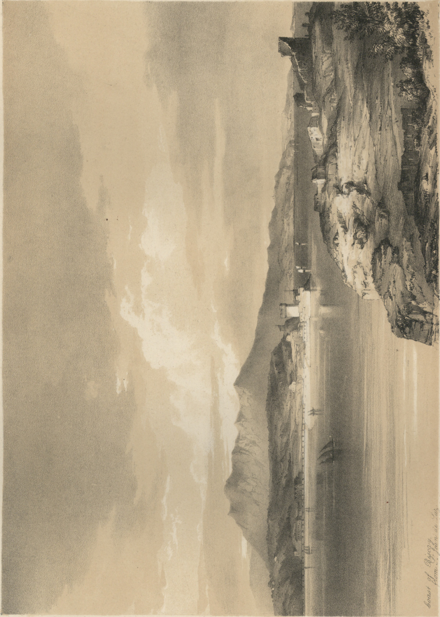
Coast of Biscaya from the Bay of Biscaya