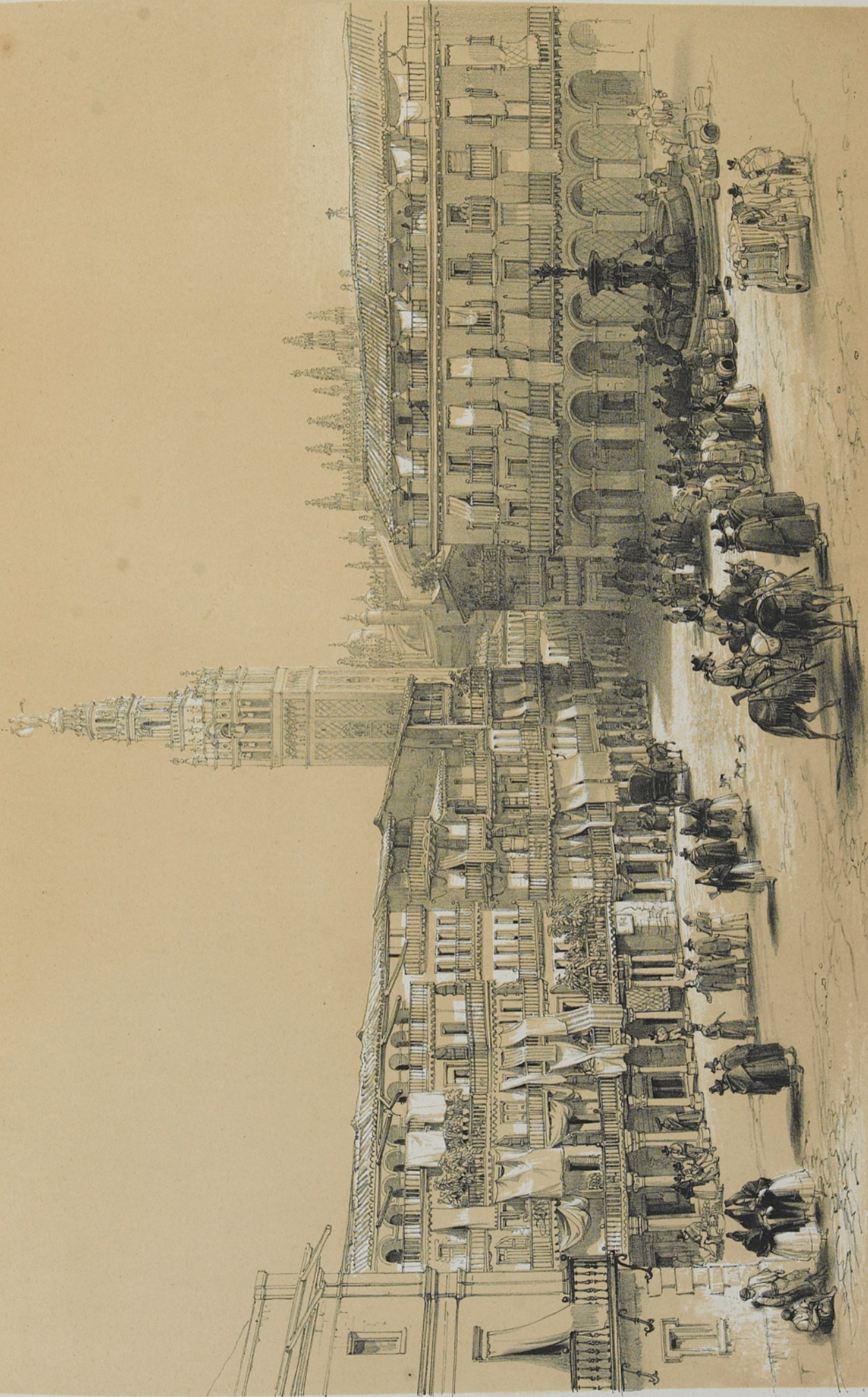
View of Mexico City