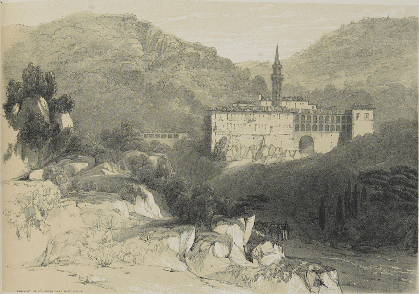
CONVENT OF ST. JEROME, NEAR BARCELONA