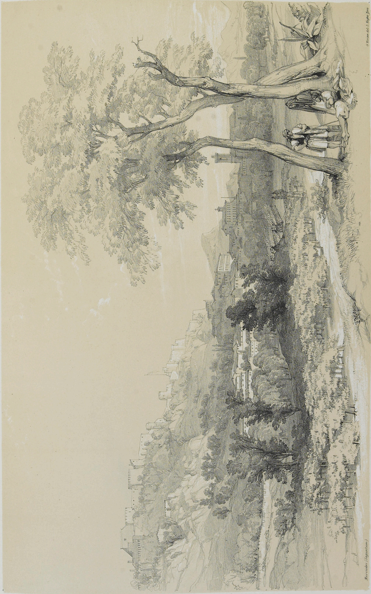
© Thomas G. L. Knappe, Inc.