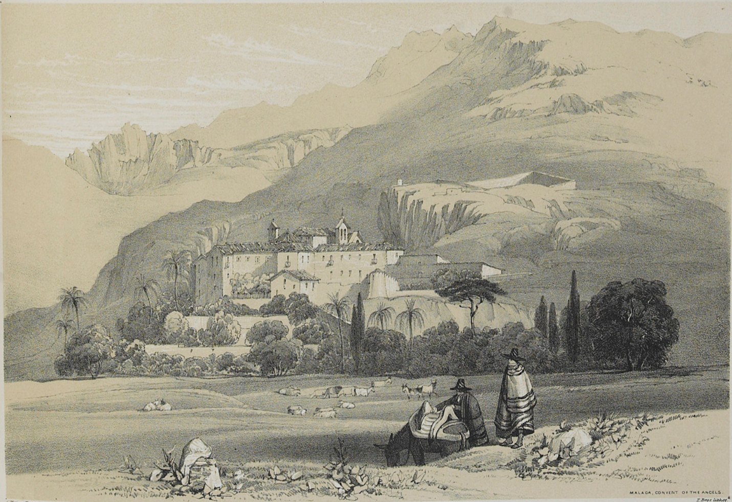
MALAGA, CONVENT OF THE ANGELS.