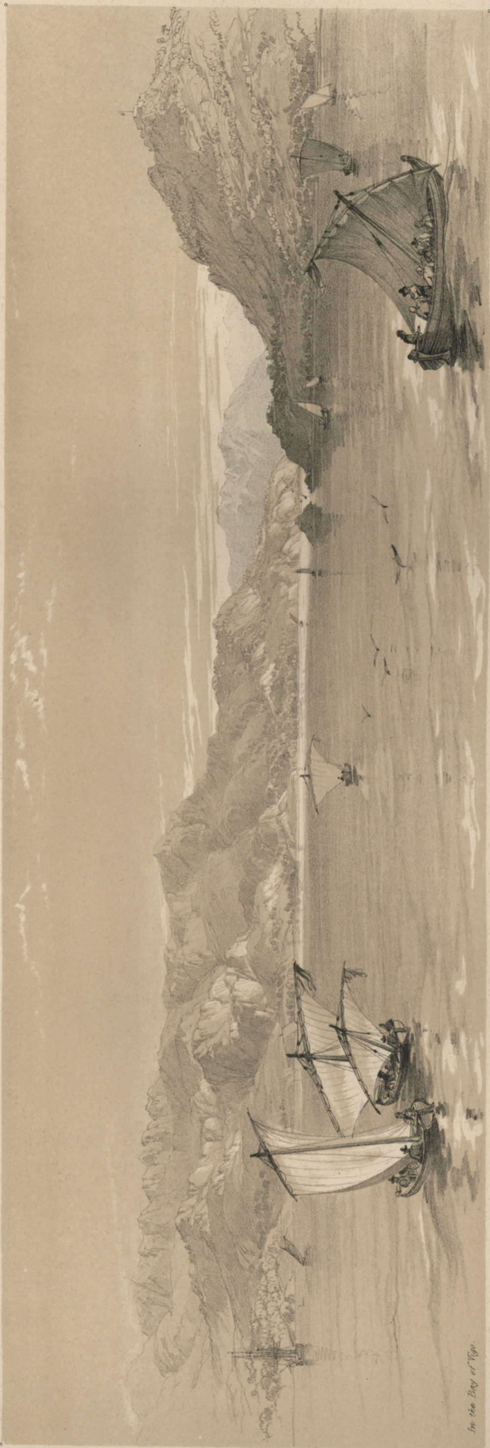
In the Bay of Vigo.