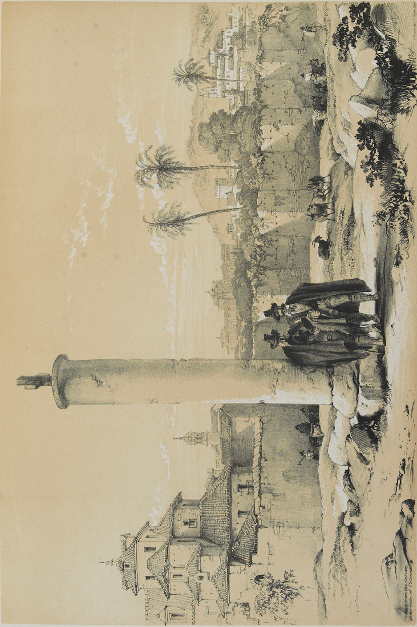
Cordoba, from the Calvario At the base of the Tower