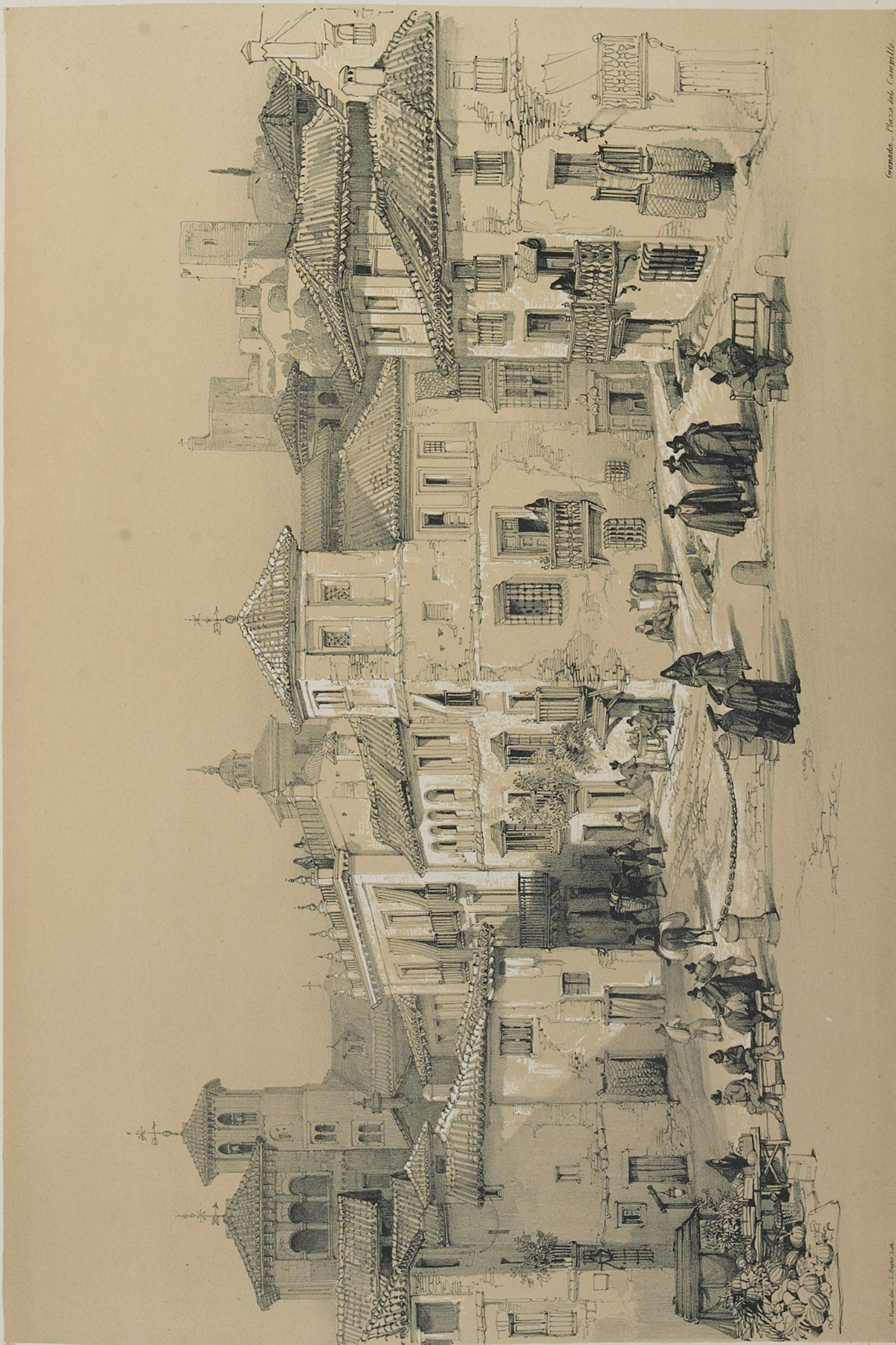
Granada. Plaza del Campello.