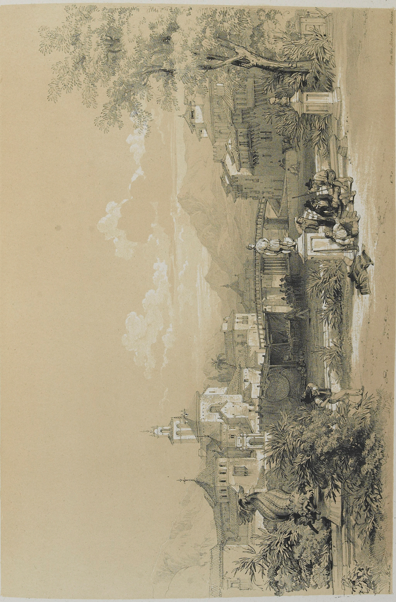
From the Alameda, Mexico