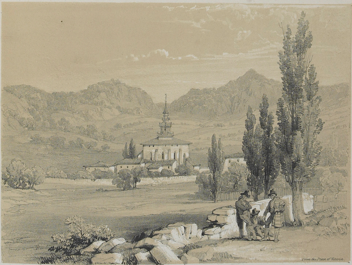
From the Plain of Vitoria