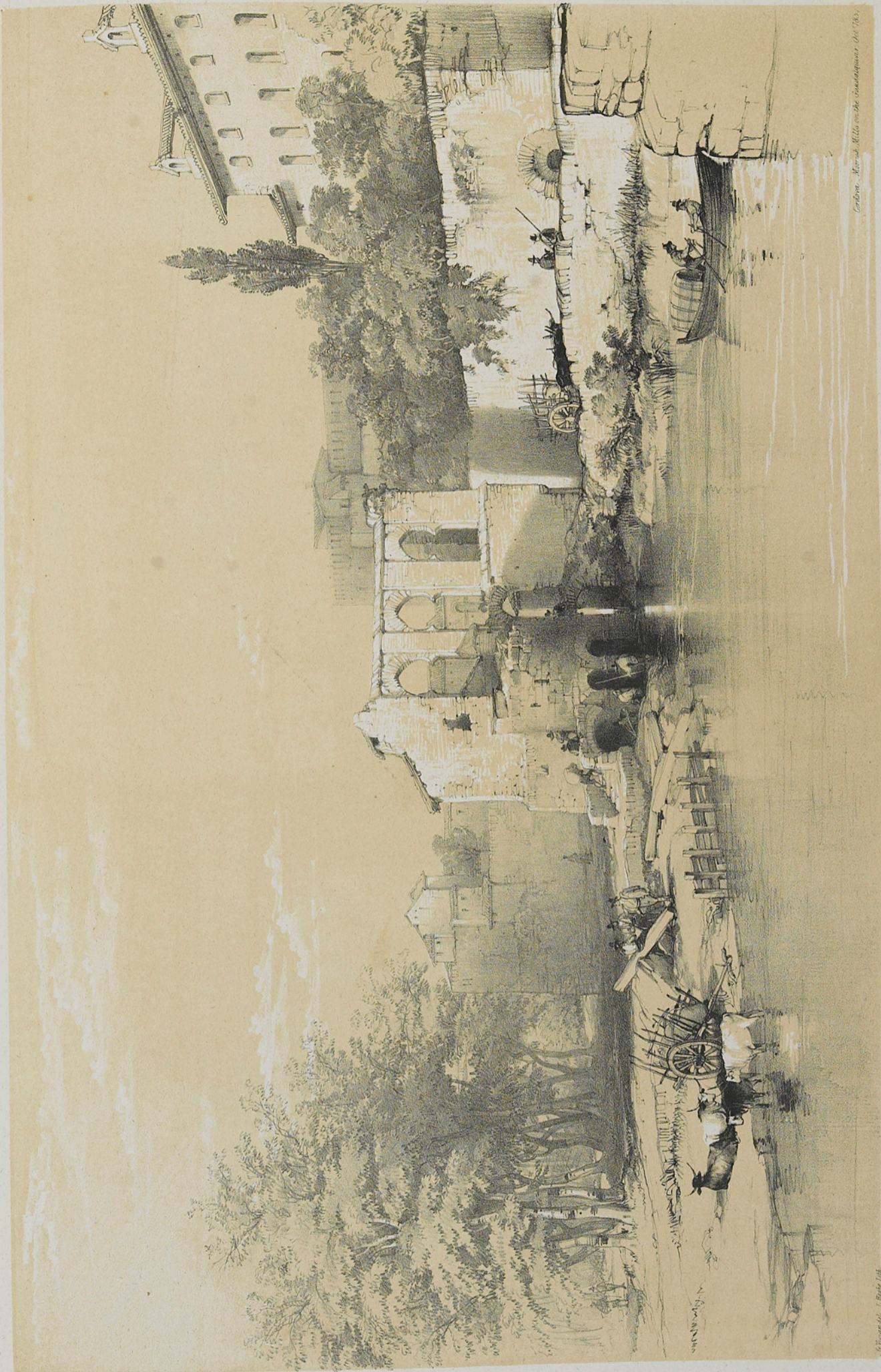
Cairo. View of the Citadel and the River Nile.