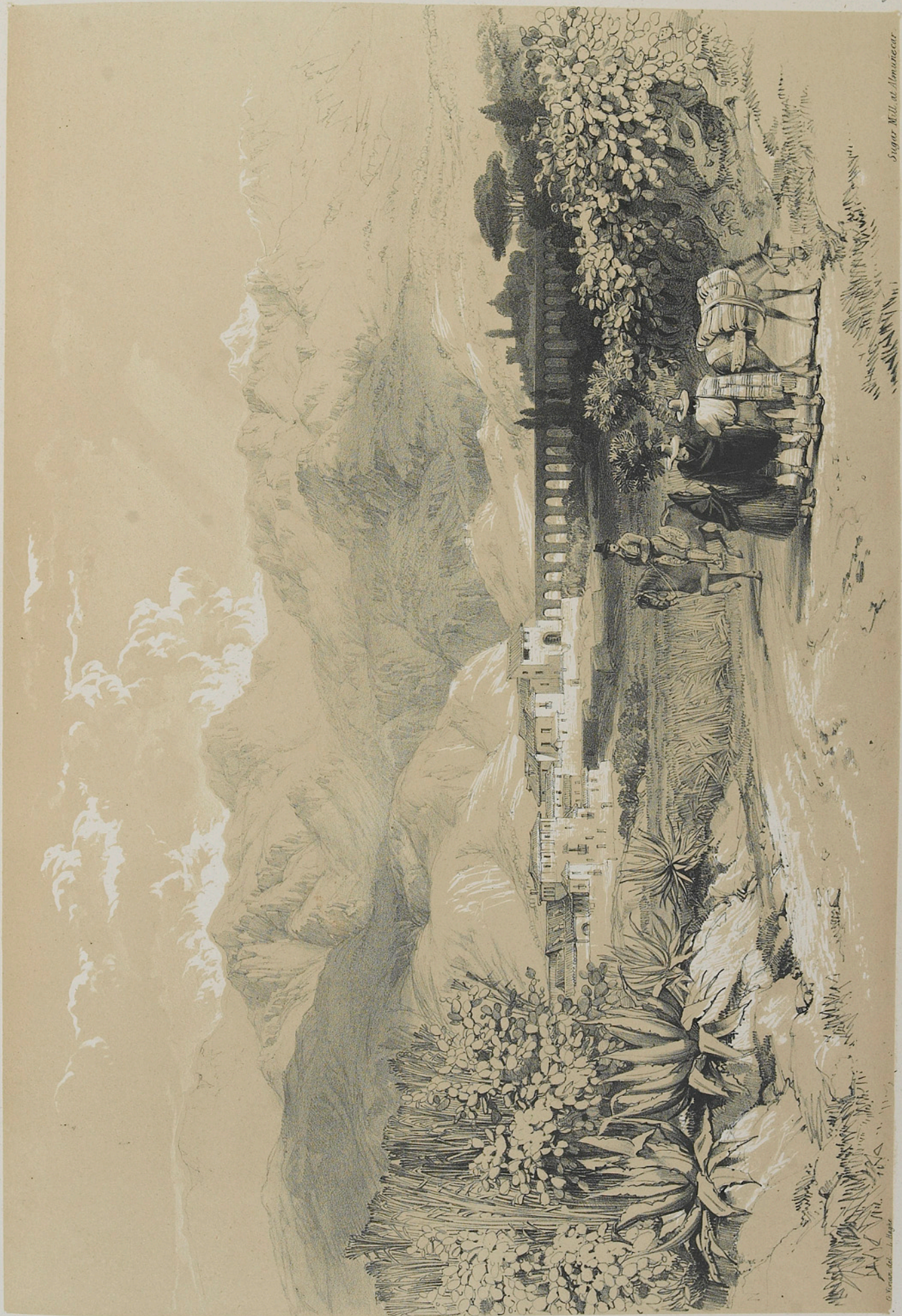
Sugar Mill at Amurcar