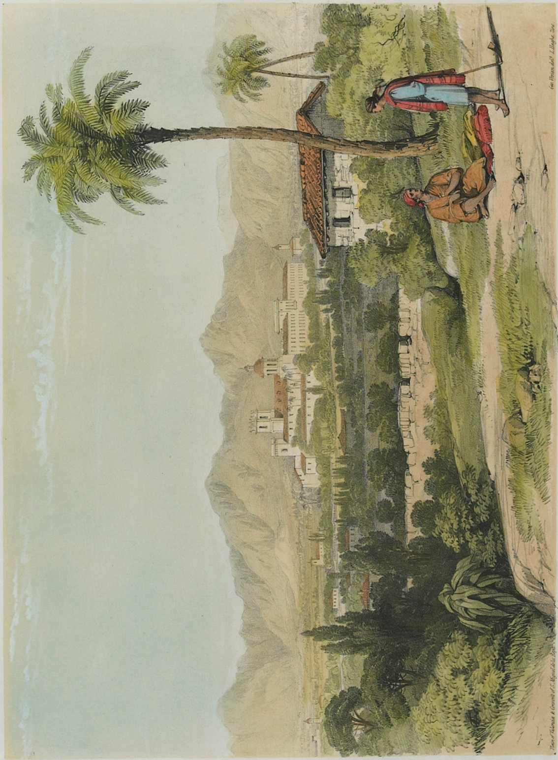
San Francisco de Asis, Peru