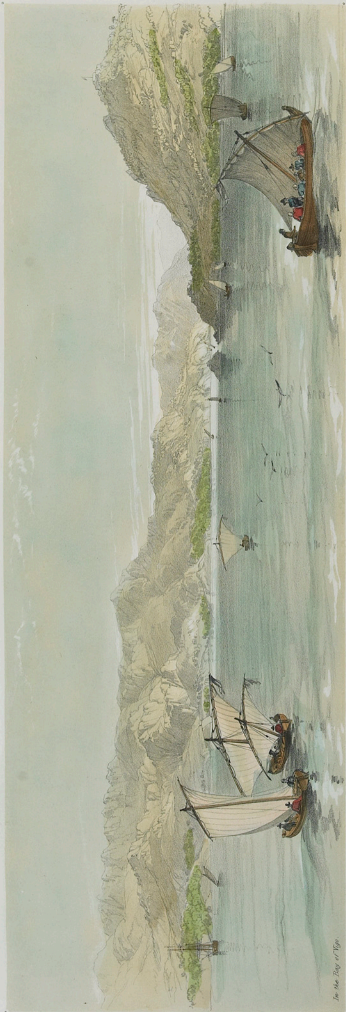
In the Bay of Vigo.