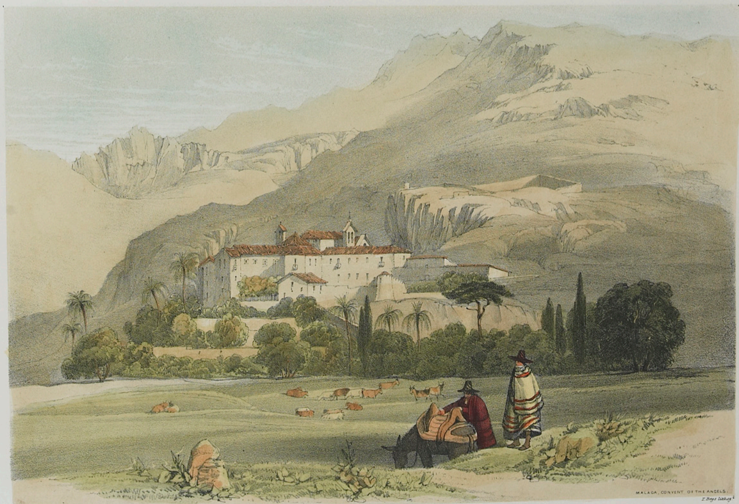
MALAGA, CONVENT OF THE ANGELS