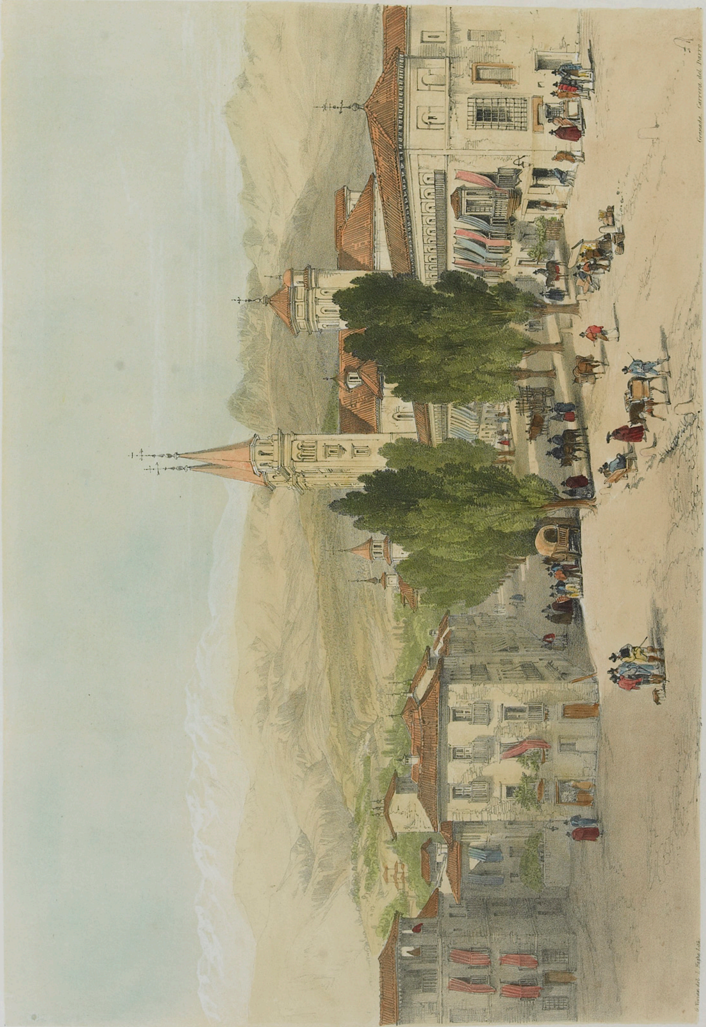
Granada. Carrera del Duero.