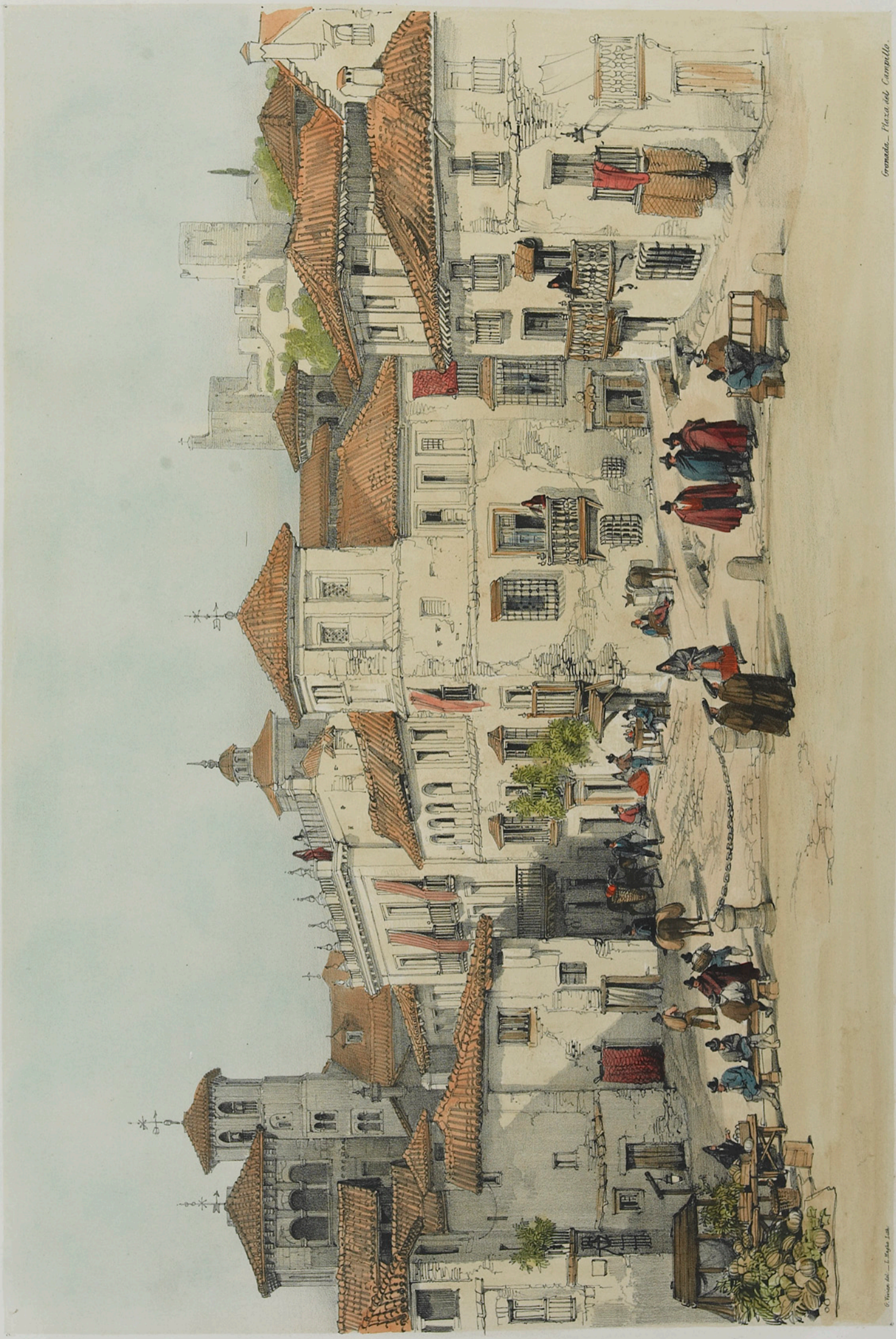
Granada. Plaza del Campello.