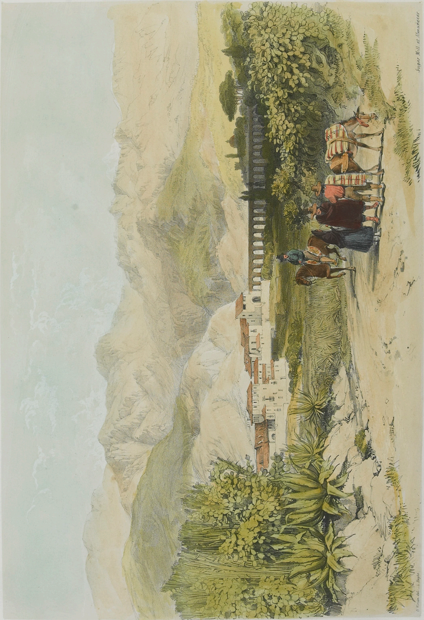
Sugar Mill at Abasco