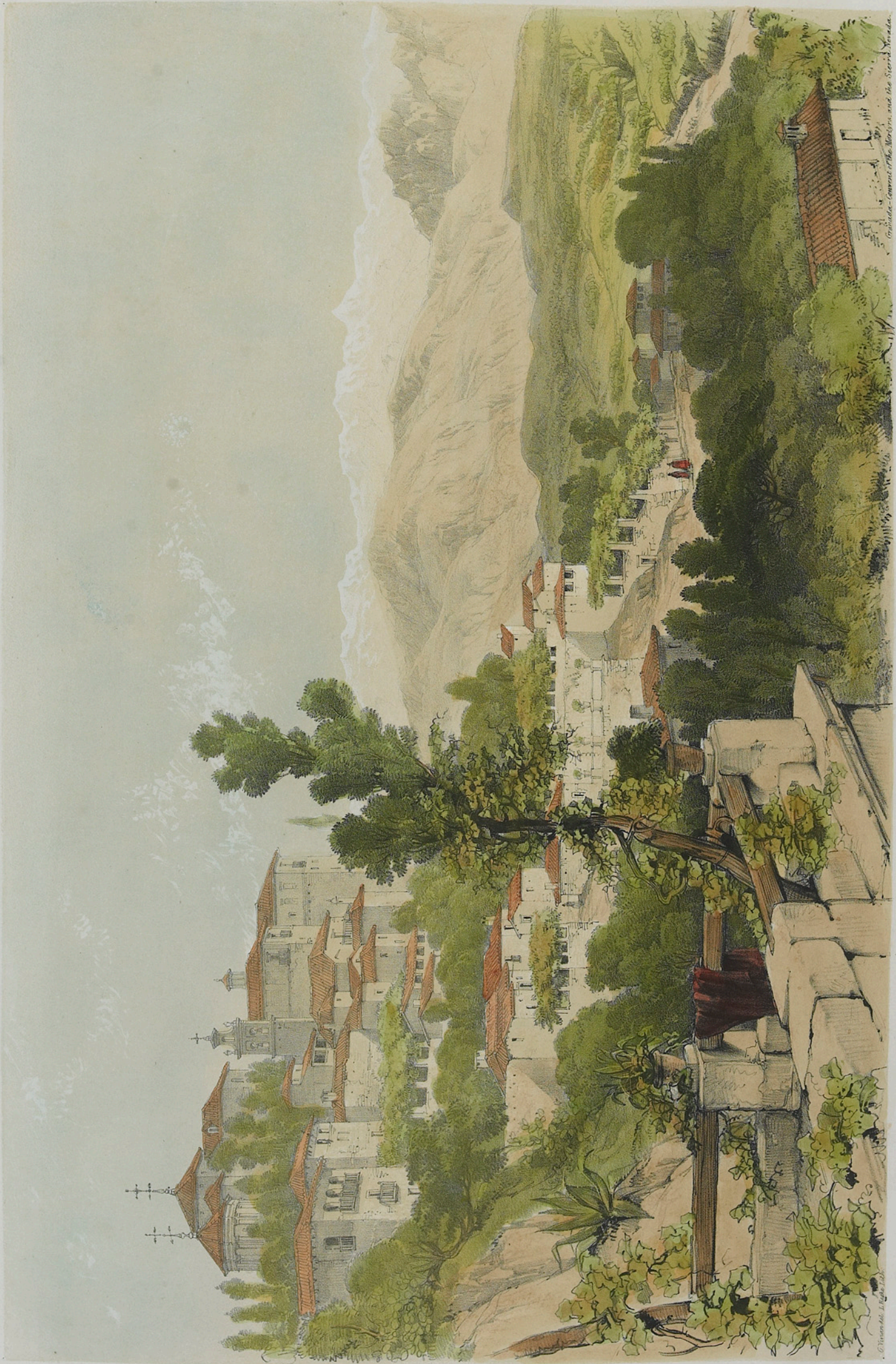
Trinidad - General of the Moros and the Sierra Nevada.