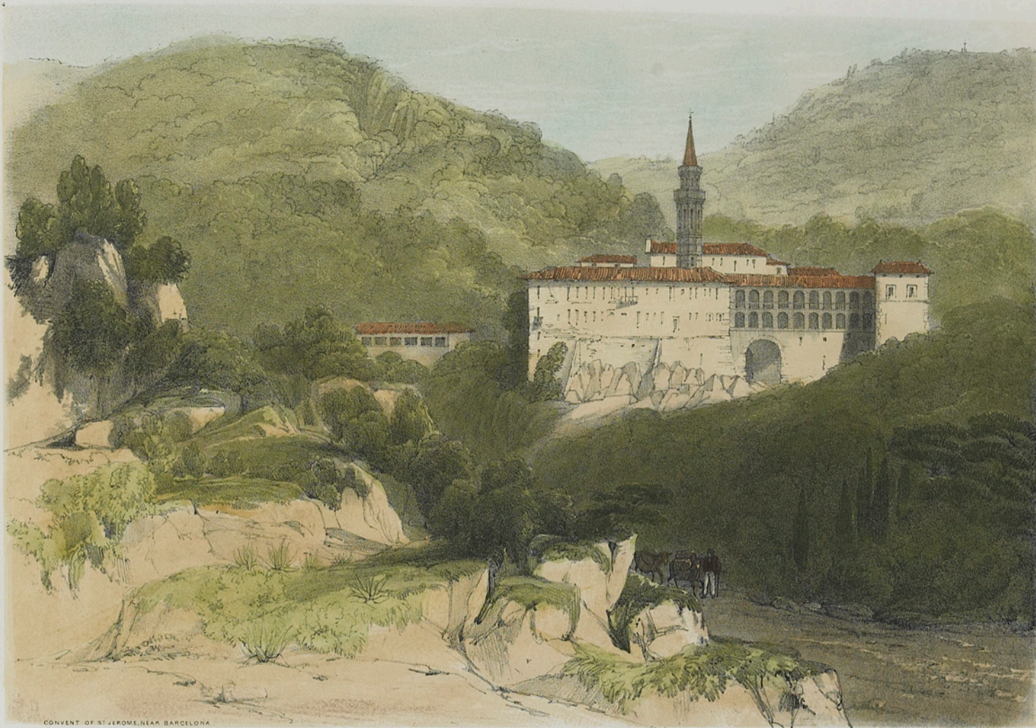
CONVENT OF ST. JEROME, NEAR BARCELONA