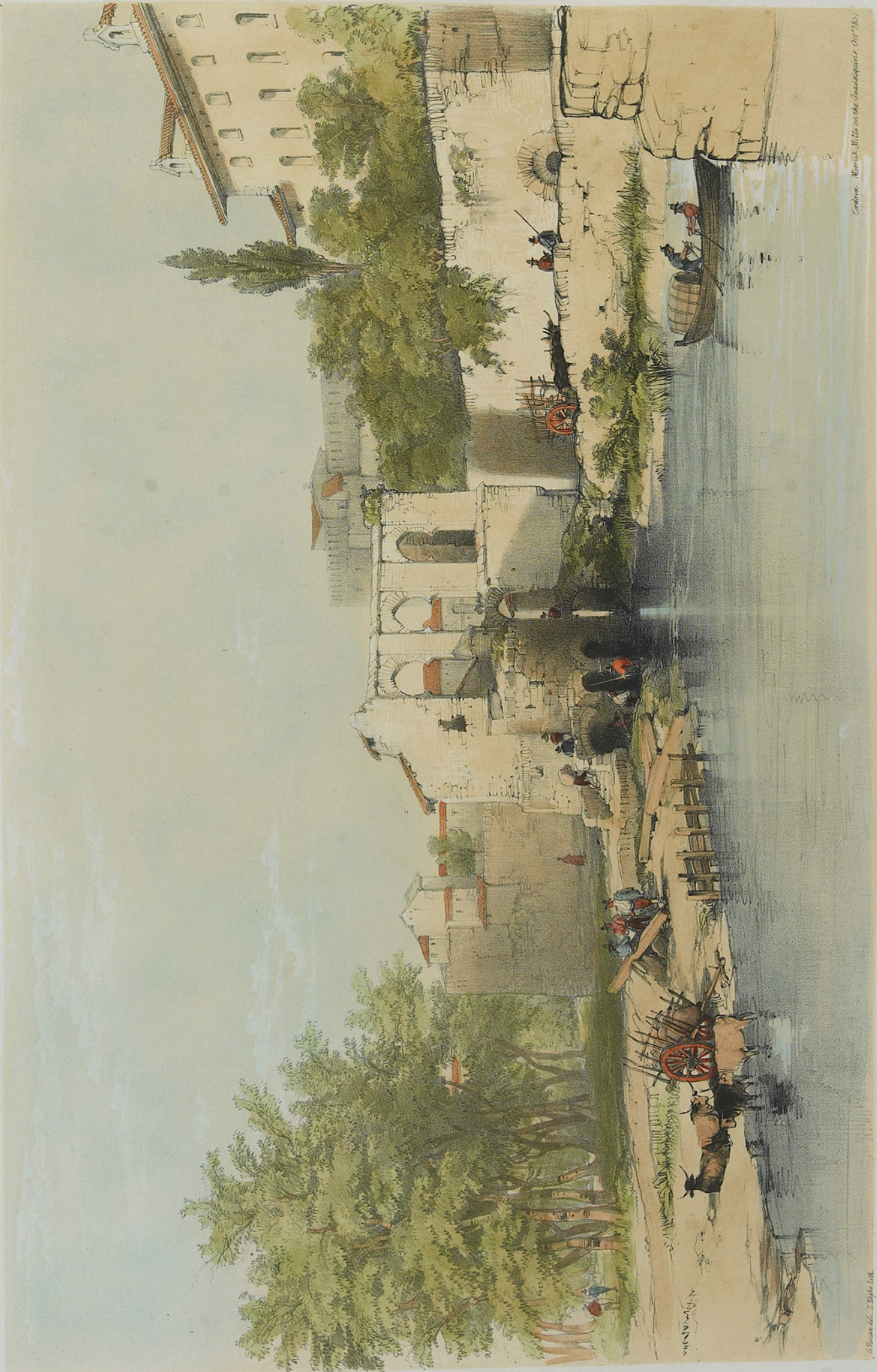
Cordova, Mexico. Mills on the Guadalupe. Oct 1883.