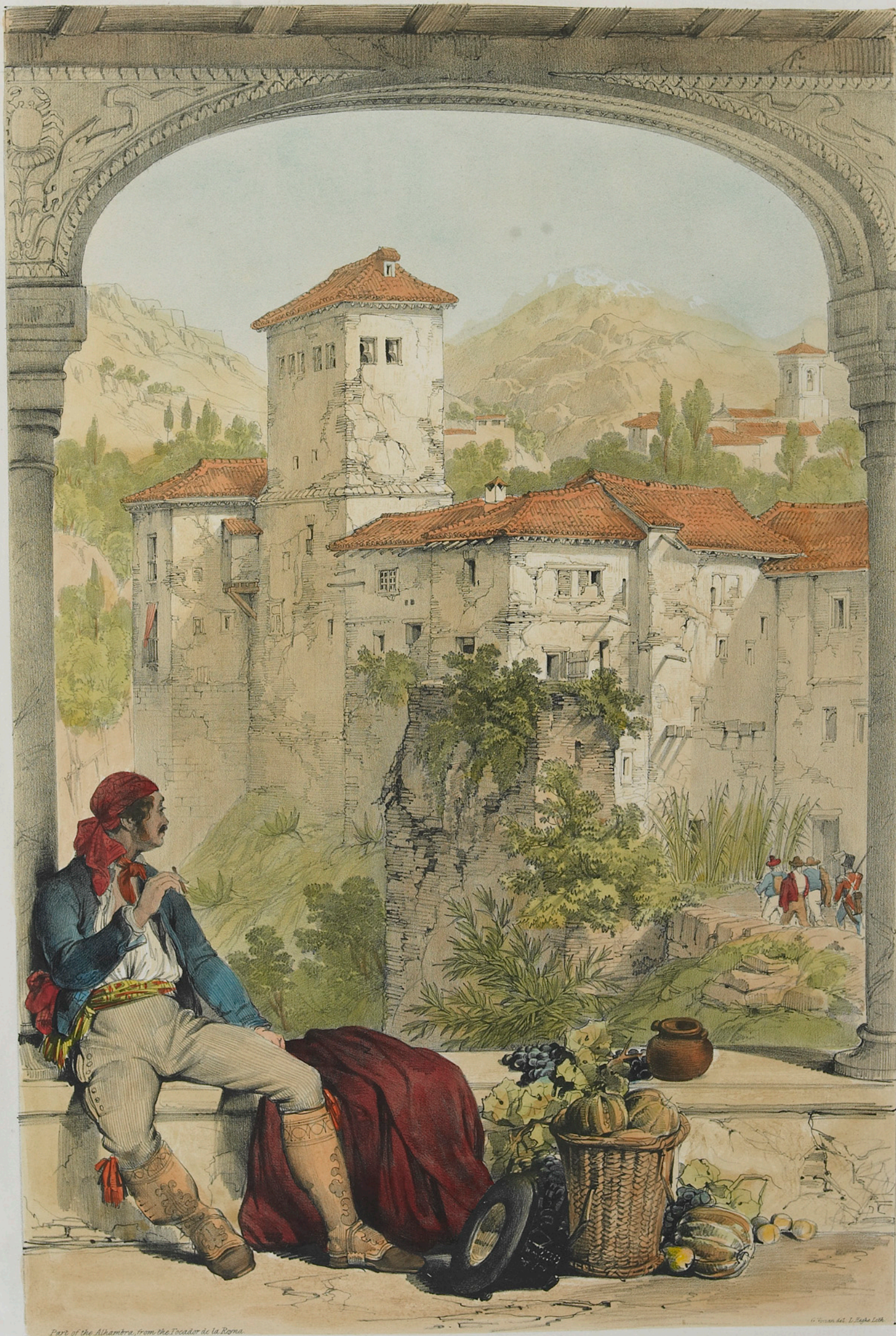
Part of the Alhambra, from the Tocador de la Reina.