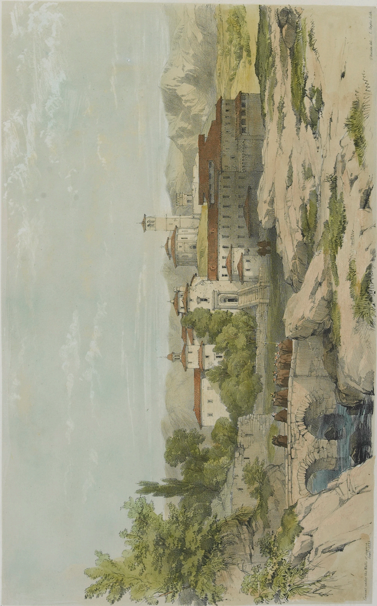
View from the Walls of Capri, Italy