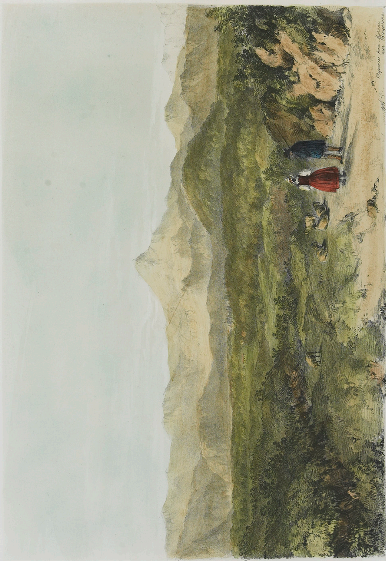
Expansu from Abruzzo near Roccaraso