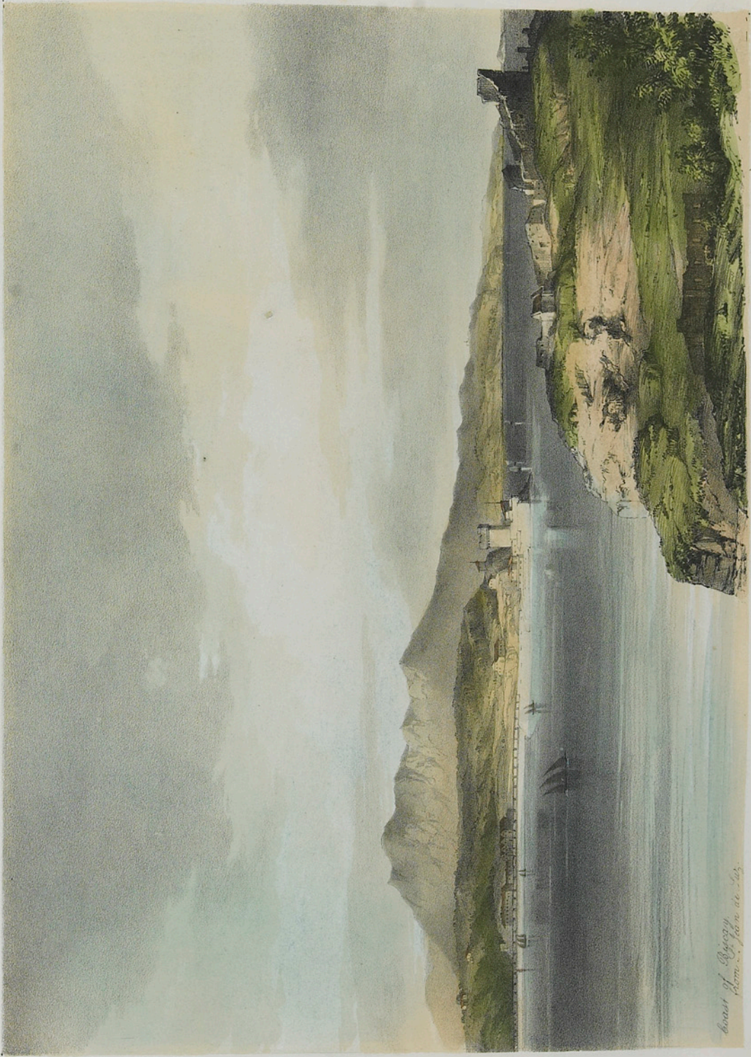
Coast of Rio de Janeiro, Jan. 1843