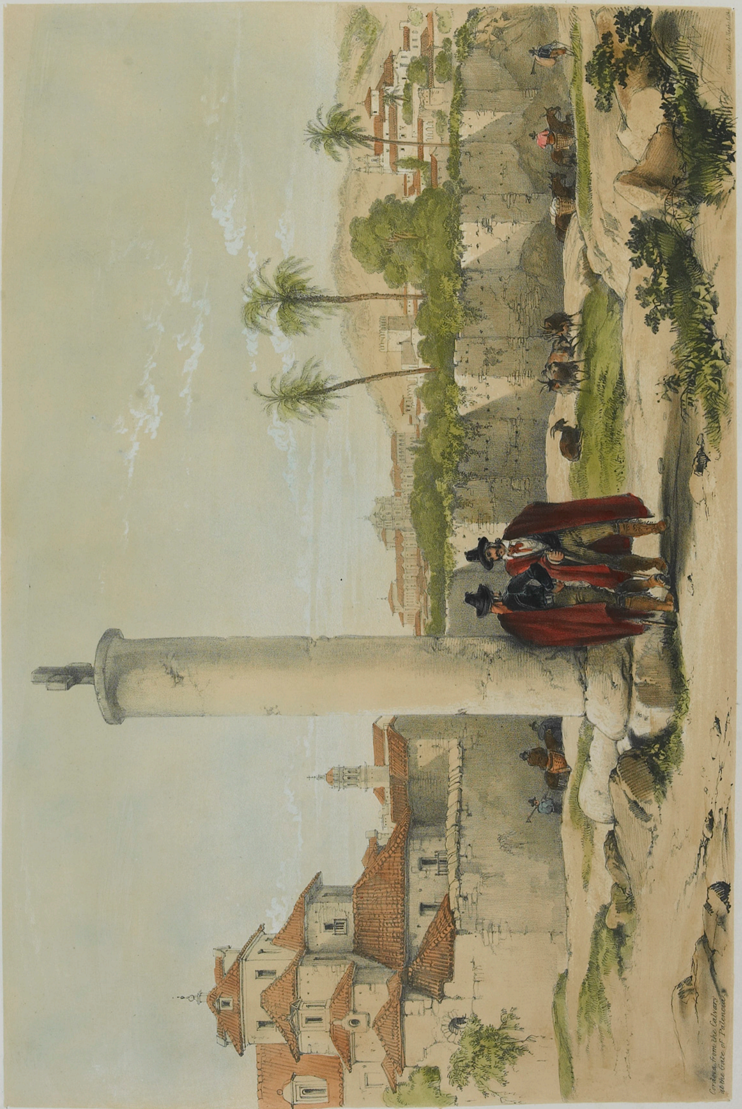
Cádiz, from the Calvary at the Gate of Palenques