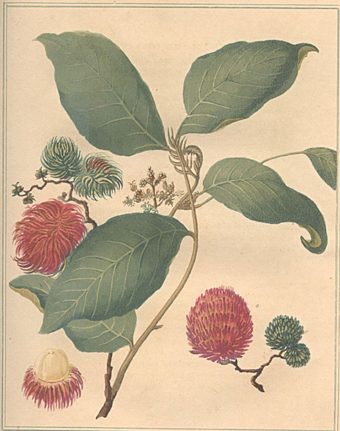
The Ramboutia a Fruit of the Poobuang

Collected Nov. 2, 1817 by Hugh Vahl, Esq. Botanic Garden London