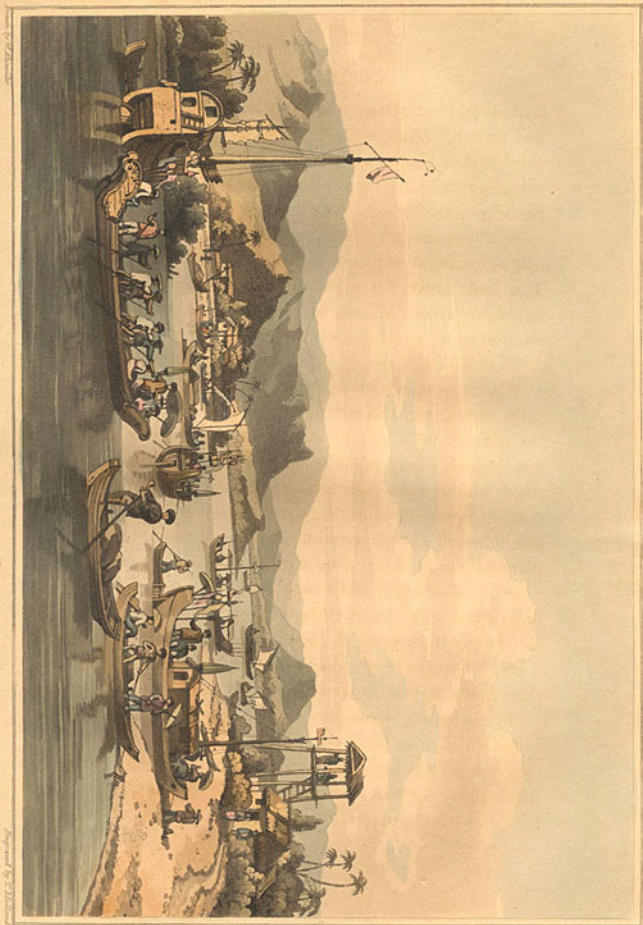
Cochin Chinese Shipping on the River Tajo