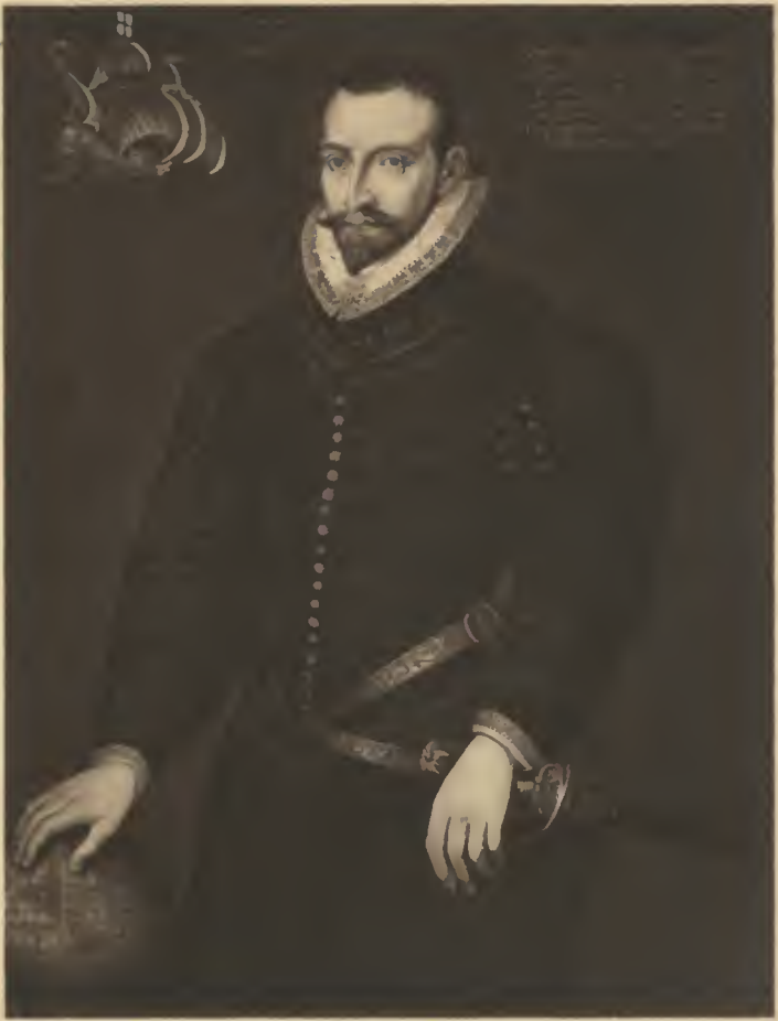
Sir James Lancaster