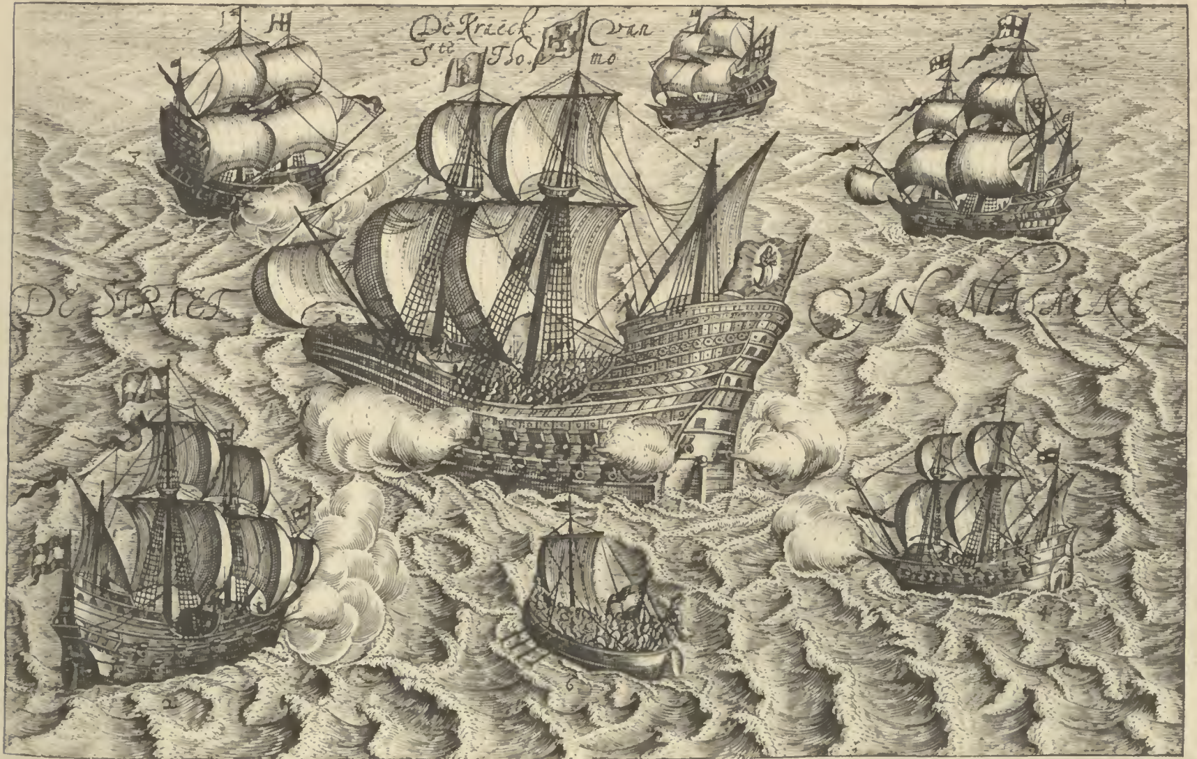
THE FIGHT WITH THE CARRACK

Folio 52. Dese afbeelding kan't nemen van de Craike van St. Thomé, moet hier ghestelt zijn Nombre 1. Dit is den Generael van dese Enghelsche Schepen/Lanester.Nombre 2. Den Generael Spielberge.Nombre 3. Capiteyn Middelton.Nombre 4. De Jacht het Lam.Nombre 5. De Jacht van de Enghelschen.Nombre 6. De Chaloupe vanden Generael Spielbergh.