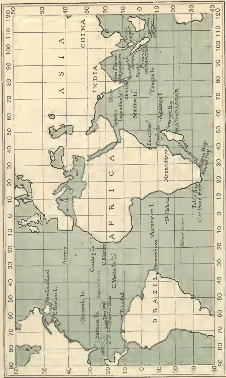
A GENERAL MAP OF THE INDIES