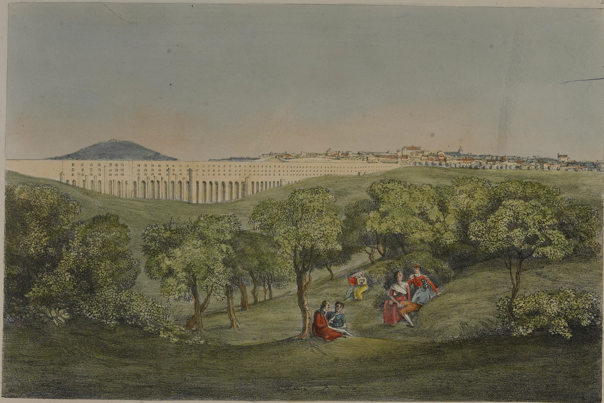
Colonne à Fort La Hippie