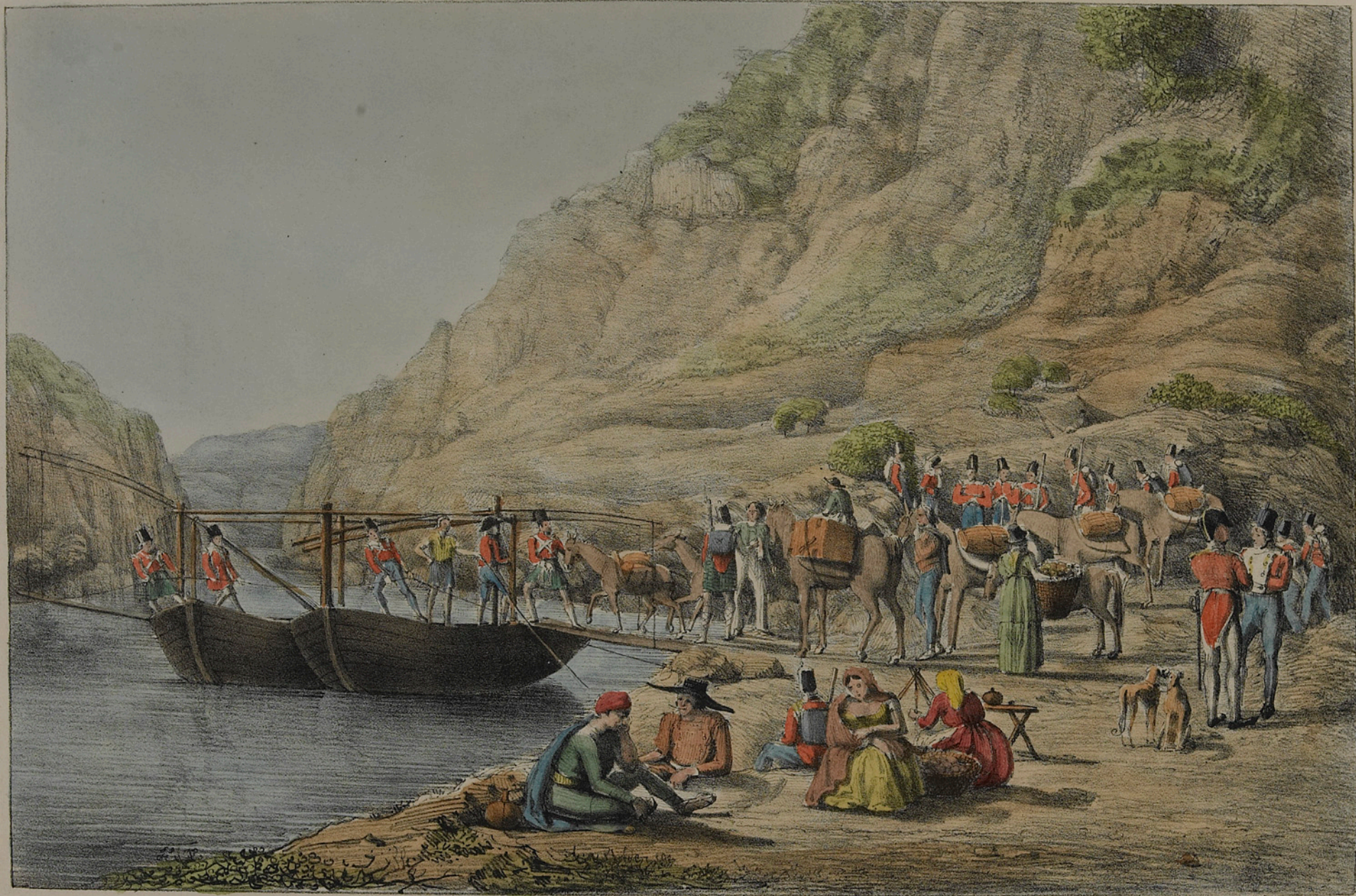
The Tagus at Villa Velha