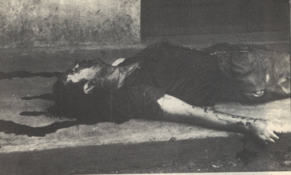
White settler assassinated near Carmona during a Terrorist attack.