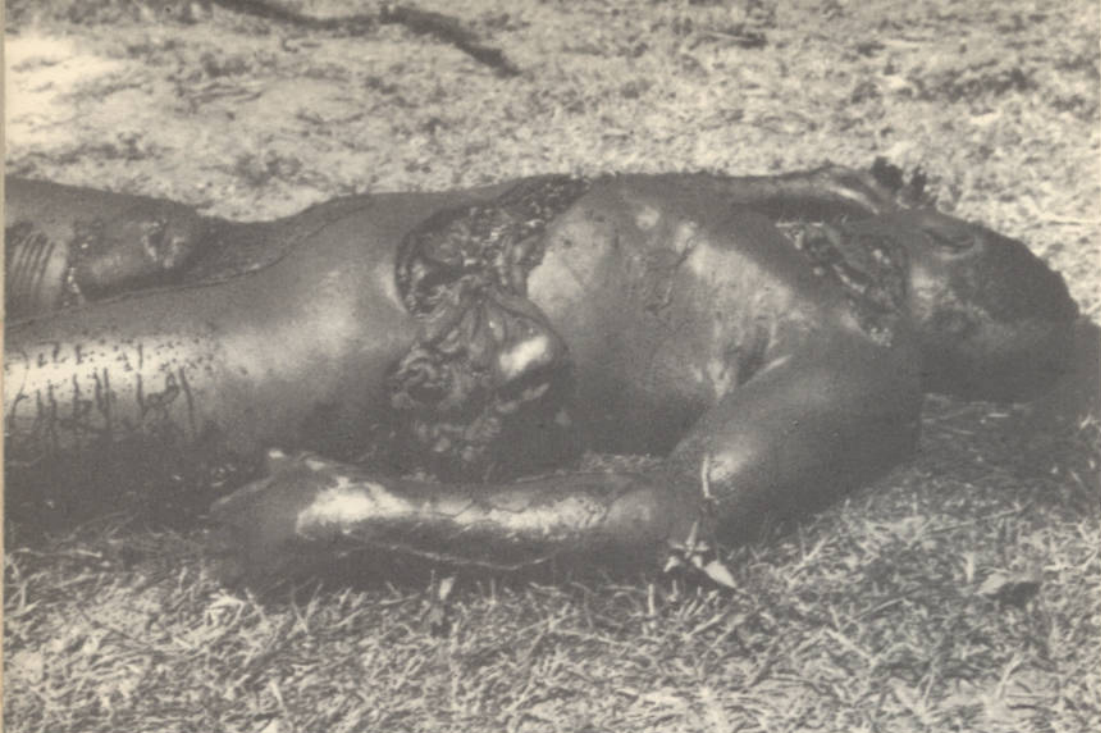
Coloured Portuguese assassinated with a bush-knife.