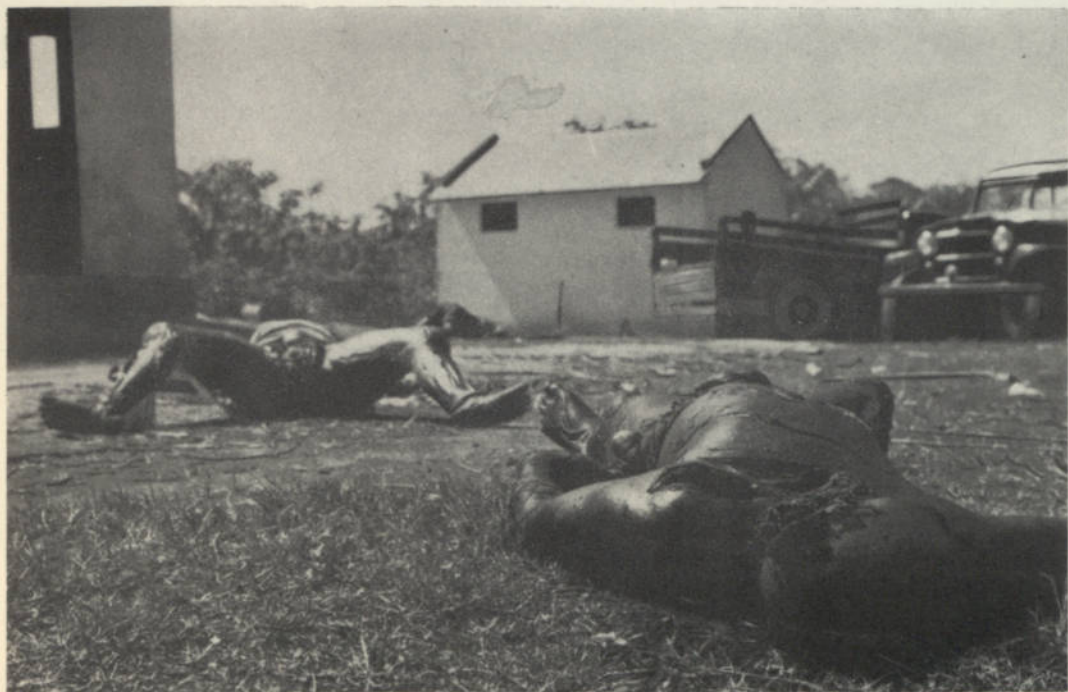
Angolan native victims of Terrorist barbarities.