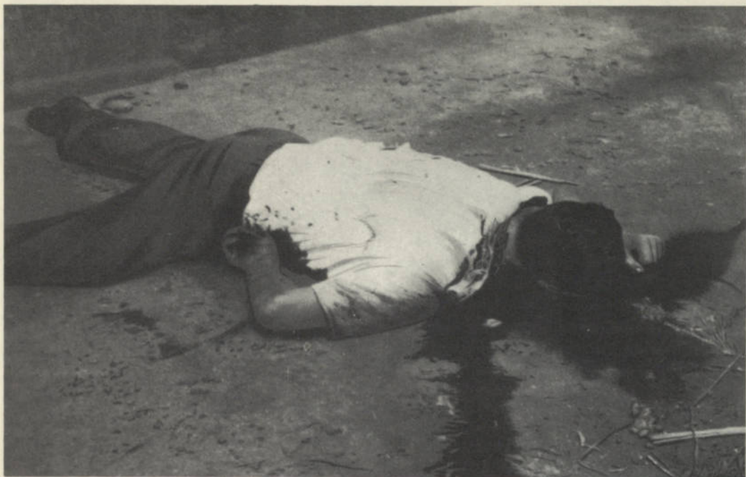
White settler bush-knifed to death.