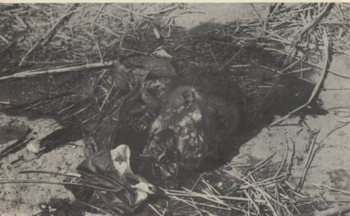
Horribly mutilated Portuguese native.