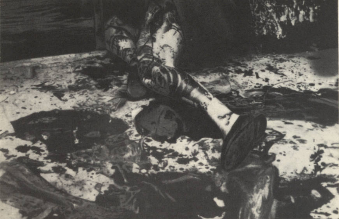
Human remains found after a Terrorist attack.