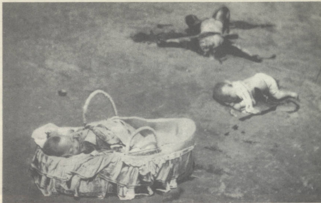
Bush-knifed children lying near their decapitated negro nursemaid.