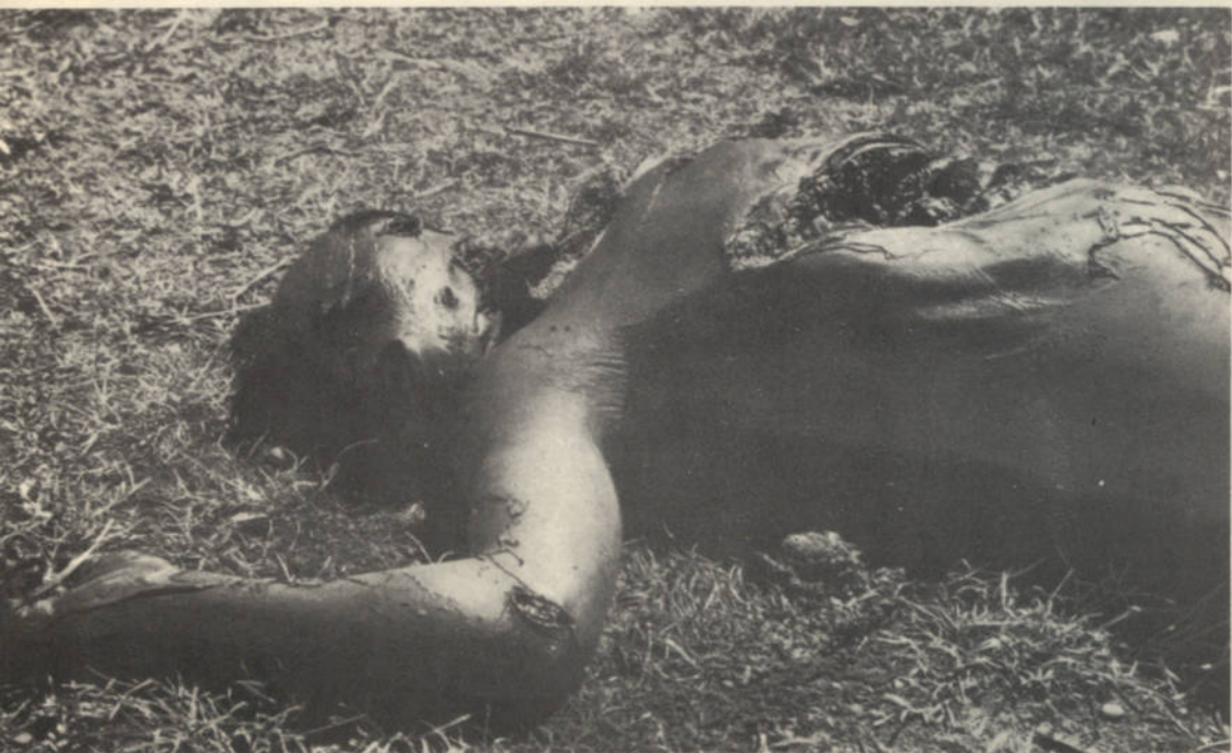
A Portuguese negro, disembowelled and decapitated.