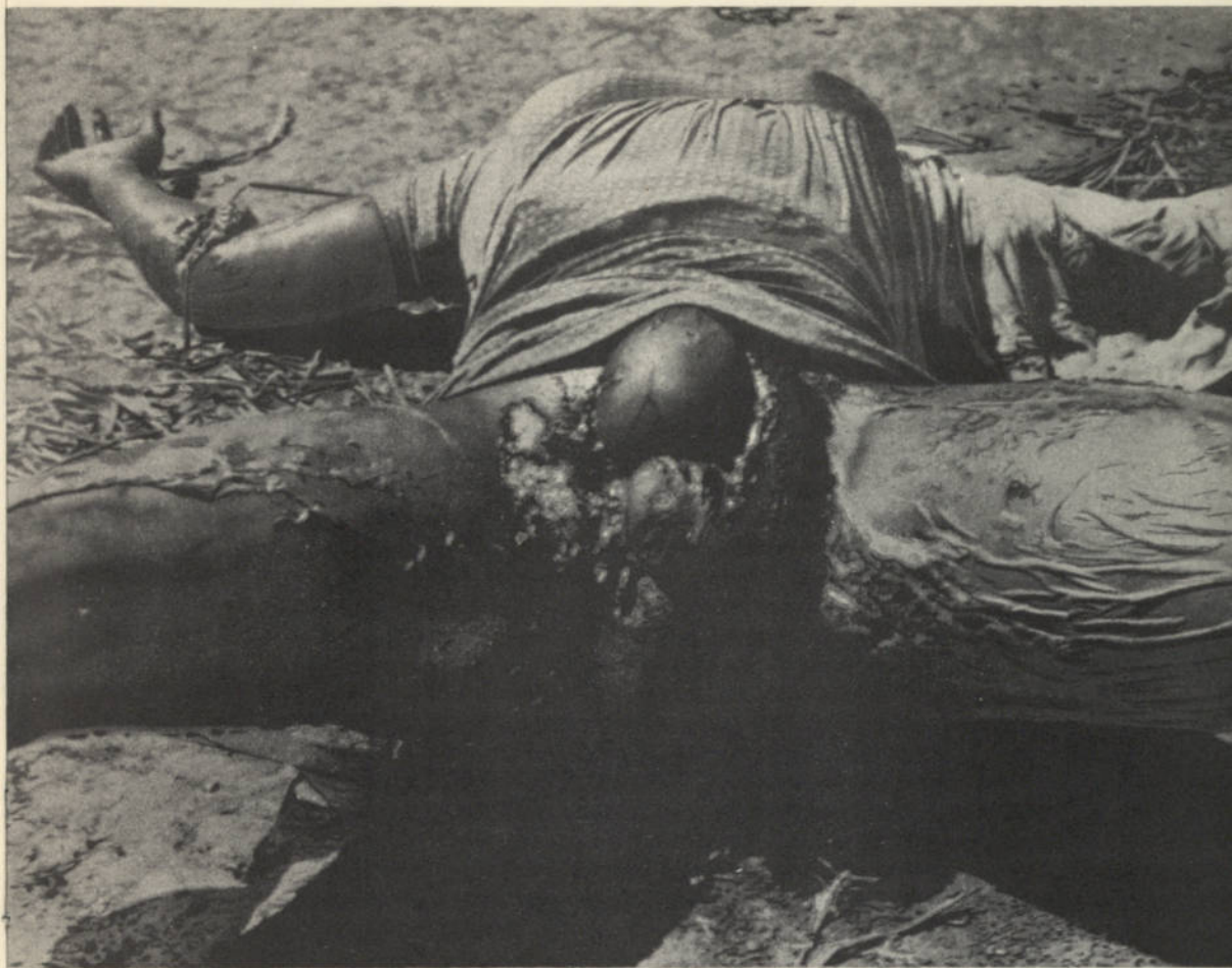
Native woman, breathered to death with horrible cruelty.