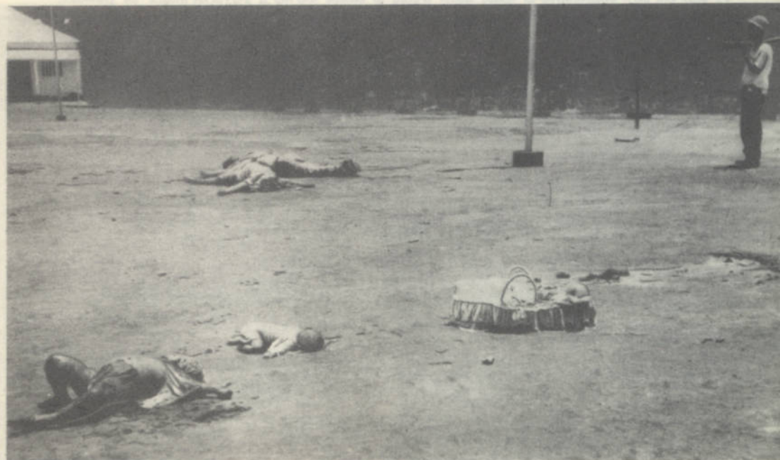
Bush-knifed children lying near their decapitated negro nursemaid.