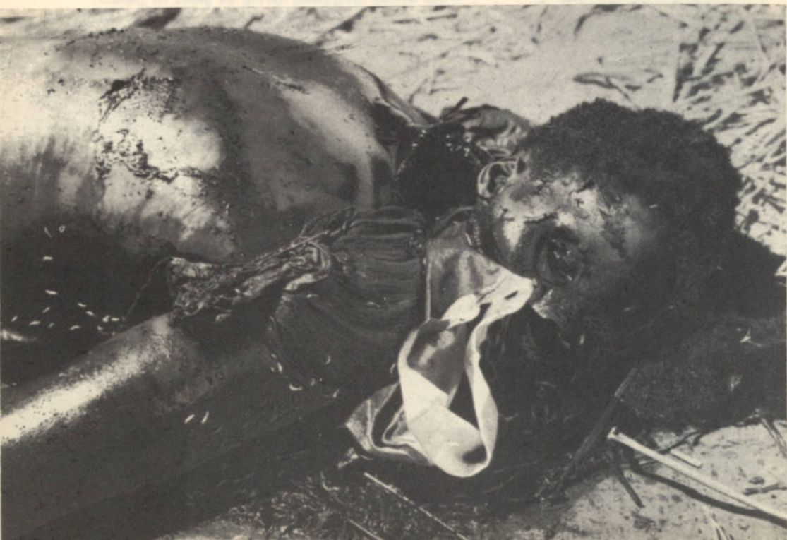
Horribly mutilated Portuguese negro whose eyes were plucked out while he was still alive.