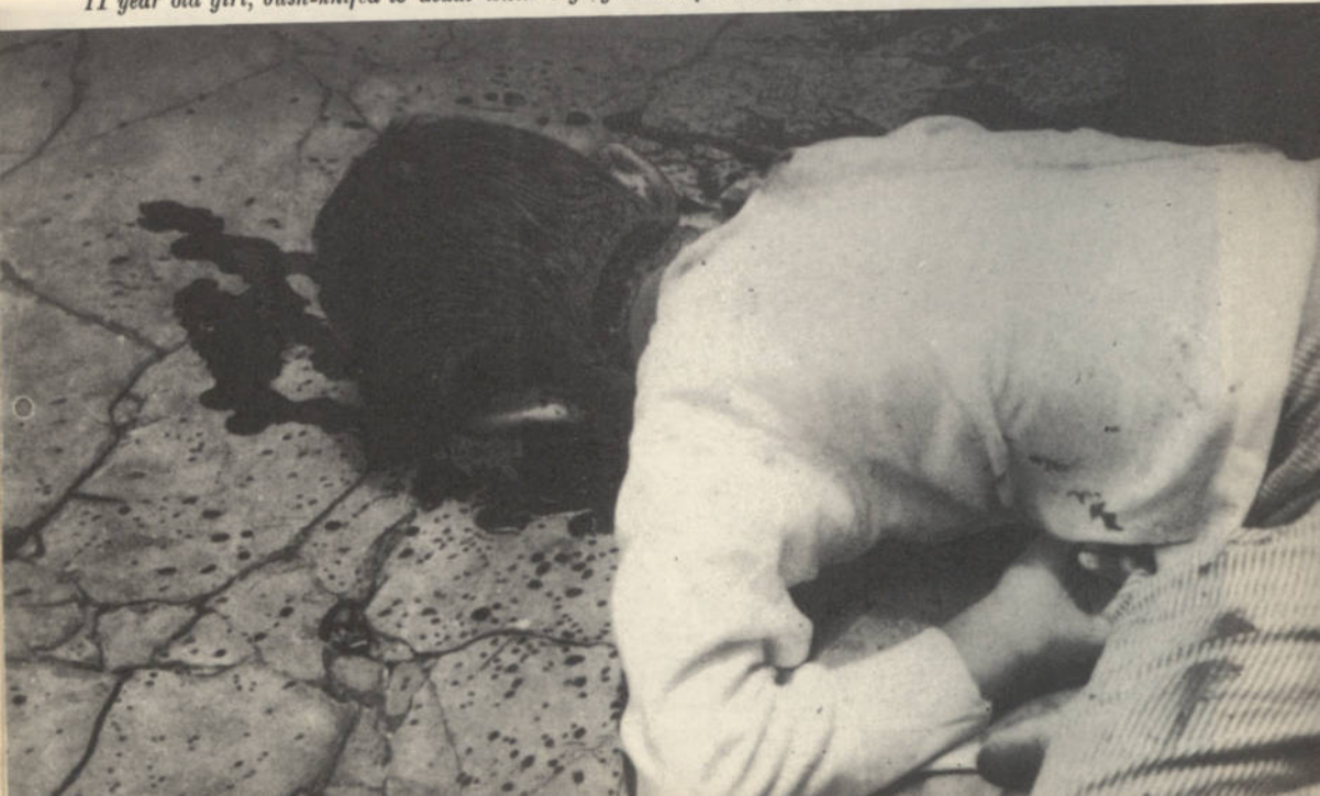
11 year old girl, bush-knifed to death while trying to escape during a Terrorist attack on Quibaxe.