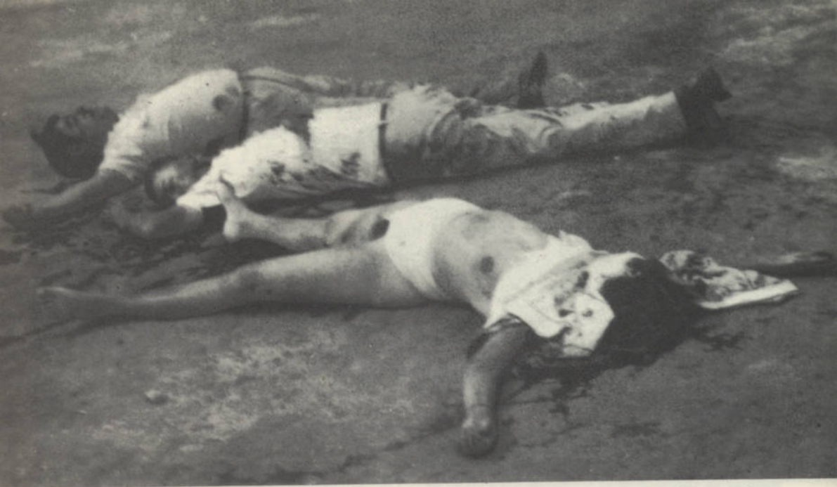
Whites assassinated after a woman had been raped.