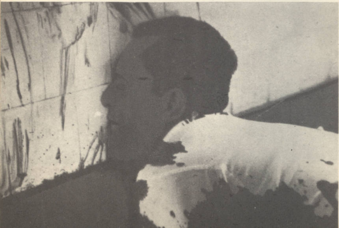
Angolan journalist, found assassinated in this position.