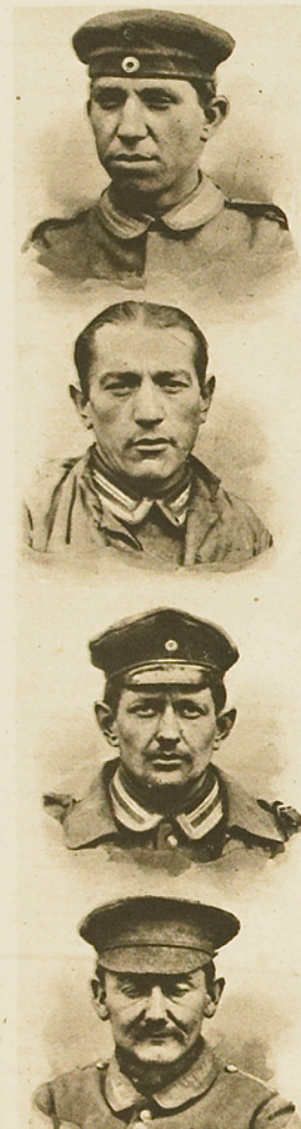
STUDIES IN GERMAN PHYSIOGNOMY: TYPES OF THE 19,000 GERMAN PRISONERS CAPTURED BY THE BRITISH ARMY DURING APRIL.