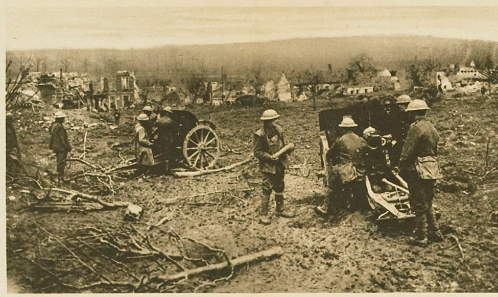
HOIST WITH THEIR OWN PETARD: BRITISH TROOPS USING ONE OF THE MANY CAPTURED GERMAN GUNS AGAINST THE ENEMY.