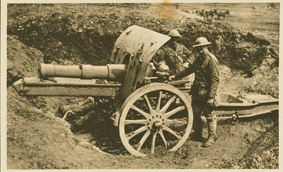
BEARING THE DATE OF CONSTRUCTION—FEB. 13, 1917: A BRAND-NEW GERMAN 5.9-INCH GUN, CAPTURED BY THE BRITISH DURING THE RECENT FIGHTING.