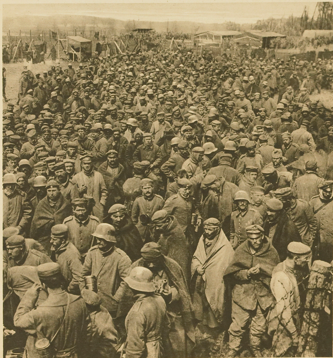
DEALING WITH SOME OF THE 19,000 GERMANS CAPTURED BY THE BRITISH DURING THE MONTH OF APRIL: A GROUP OF HUNGRY PRISONERS AT ONE OF THE ENCLOSURES BEHIND THE BRITISH FRONT.