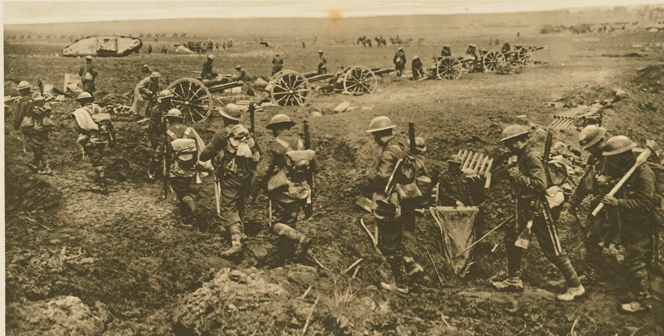
THE GREAT BRITISH ADVANCE: A REMARKABLE PHOTOGRAPH OF THE BATTLEFIELD NEAR ARRAS. IN THE FOREGROUND, BRITISH INFANTRY ARE FILING TOWARDS THE FIRING LINE; IN THE CENTRE A FIELD BATTERY IS PREPARING TO GO INTO ACTION; TOWARDS THE BACKGROUND, ON THE LEFT, ONE OF THE FAMOUS BRITISH TANKS IS ADVANCING; WHILE IN THE MIDDLE DISTANCE A HORSE-ARTILLERY TEAM CAN BE SEEN CROSSING THE TERRAIN.