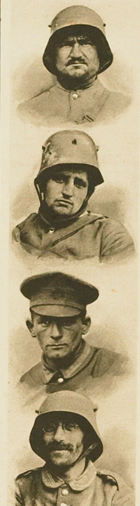
STUDIES IN GERMAN PHYSIOGNOMY: TYPES OF THE 19,000 GERMAN PRISONERS TAKEN BY THE BRITISH ARMY DURING APRIL.